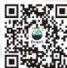
Scan for video