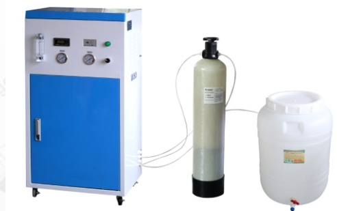
BGD 8170 Purity Water Machine