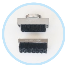
Nylon brush of ASTM D 2486