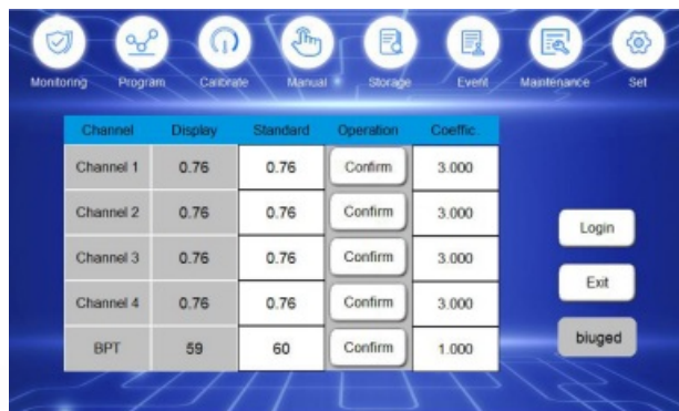
UVB Calibration Windows

The sensor of BGD 8118 calibration radiometer is very sensitive to ultraviolet rays, but don't have any action to visible light, and just have a little response for infrared light even can be ignored. So other rays can't bring any influence for this radiometer.