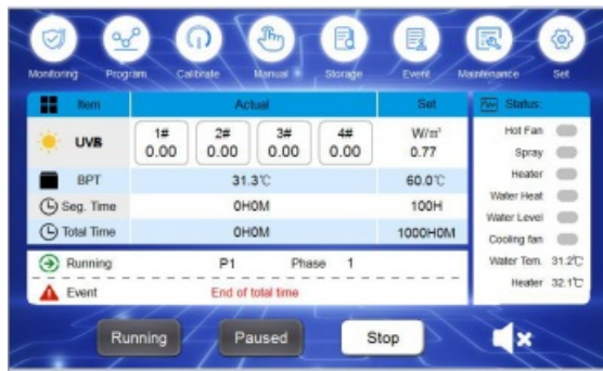
BUV Set Test Program Windows

BST (Black panel thermometer) consists of a PT100 sensor and a metal panel painted by black coating, and be exposed to the same condition as test panels. It's used to monitor exposing test panels surface temperature during test. BST can be set any value according to different requirements and also be controlled automatically during the whole test. It also can be calibrated periodically.