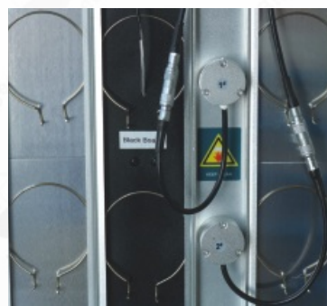
Four sensors monitor UV irradiance