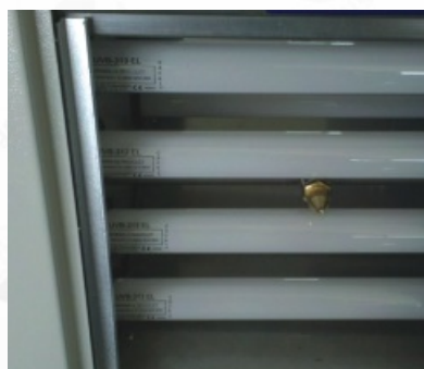
Original UV lamps from America