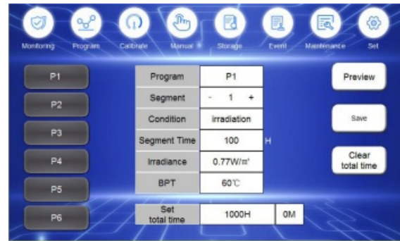
BUV Set Test Parameter Windows