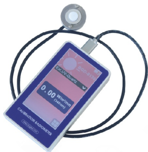
Multifunctional Irradiance Radiometer

Calibration Radiometer is made up of radiometer and sensor (see picture as below) :