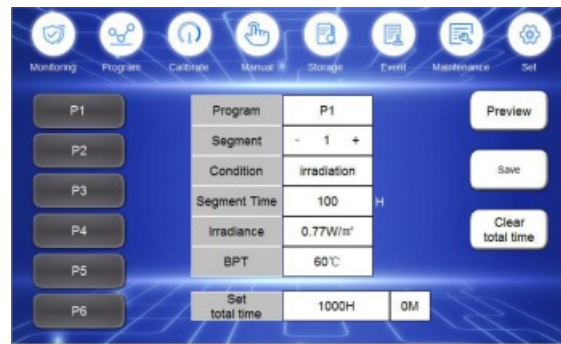
BUV Set Test Parameter Windows