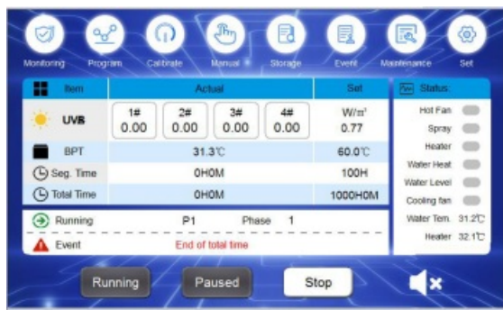
BUV Set Test Program Windows

BST (Black panel thermometer) consists of a PT100 sensor and a metal panel painted by black coating, and be exposed to the same condition as test panels. It's used to monitor exposing test panels surface temperature during test. BST can be set any value according to different requirements and also be controlled automatically during the whole test. It also can be calibrated periodically.